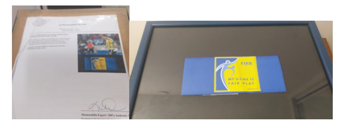
(World Cup armband and authentication, worn by 2006 Champion Team Captain Goalkeeper)