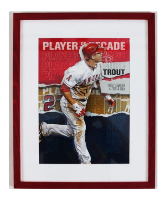
(1/1 2020 Topps Player of the Decade Poster Mike Trout)

Prognosticated to be up to a $100 billion market as long ago as 2017 ($91 billion valuation), Forbes recently published the Sports Memorabilia Market & Wealth Management estimated market at more than $15 billion per year, further noting that the market is growing at a rapid pace, driven by the sports auction market which generates over $500 million annually and is expanding as well.